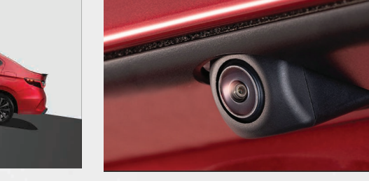
Reverse Camera Exclusive for RS and V