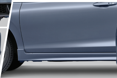
Side Sill Garnish