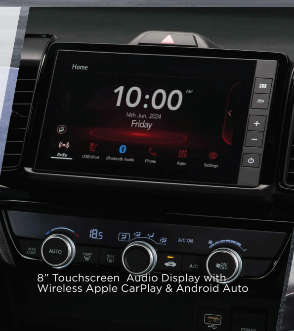
8" Touchscreen Audio Display with Wireless Apple CarPlay & Android Auto

The City Hatchback is equipped with advanced features perfect for long drives or short trips around the city.