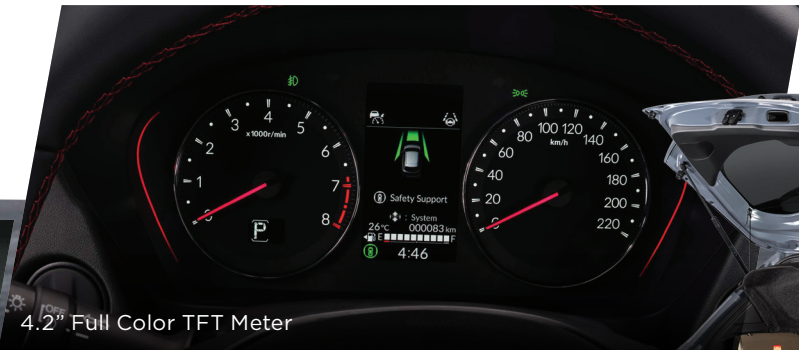
4.2" Full Color TFT Meter