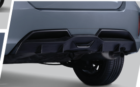
New Rear Bumper